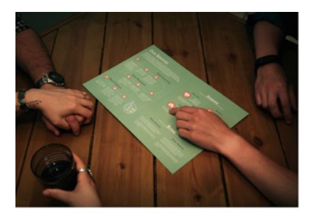
Figure 2: Materials and enactments from Abacus Datagraphy.

through which technological change can be explored, while still being rooted to a familiar present. This kind of work requires identifying aspects of the present which are expected to change over a longer period, and those which might be more radically shifted by new socio-technical phenomena. We can consider the contemporary social rituals and phenomena that may bear resonance to DAO's? Early examples like Kash cups, and BitBarista [14] arguably rely on the already familiar routines of drinking coffee. Imagination is required to recognise the implicit existence of distributed ledgers in everyday life – from paying council tax, to buying rounds in the pub.